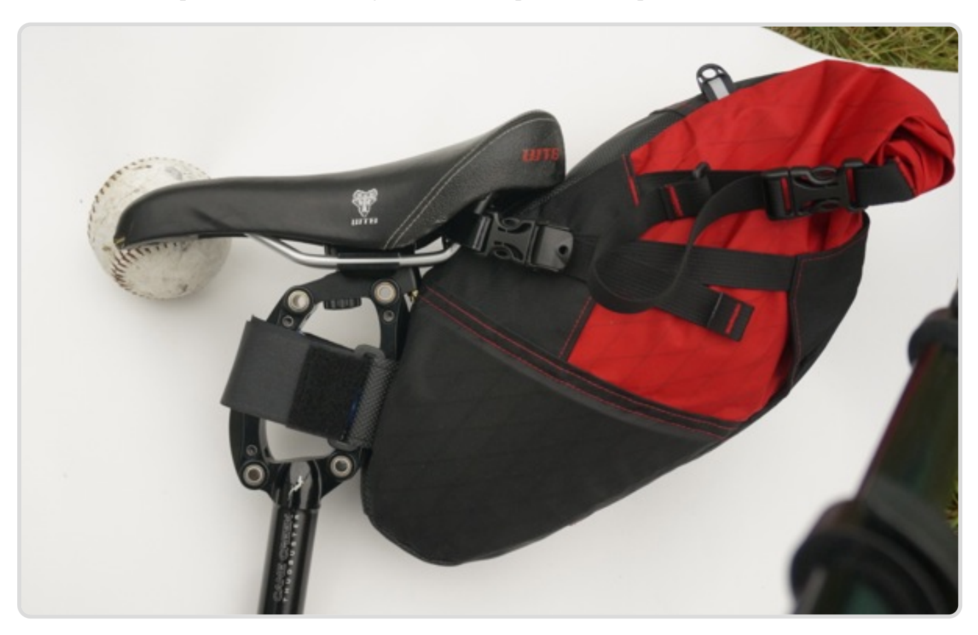
Pika on LT: Run the saddle strap in the rear position.

Viscacha with LT post: Here it's running the saddle strap in the front position.