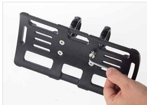
Figure 1, Step 2