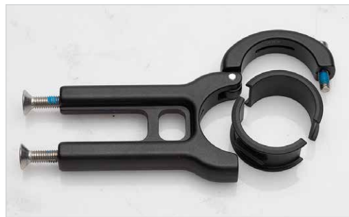
Figure 1, Step 1